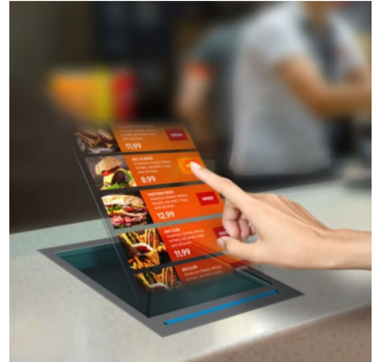
Holo Industries holographic-touch product.